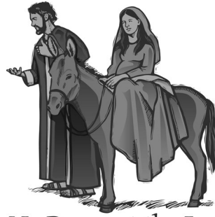
No Room at the Inn

Each of Us is... an Inn Keeper who decides if there is room for JESUS in Our Lives!